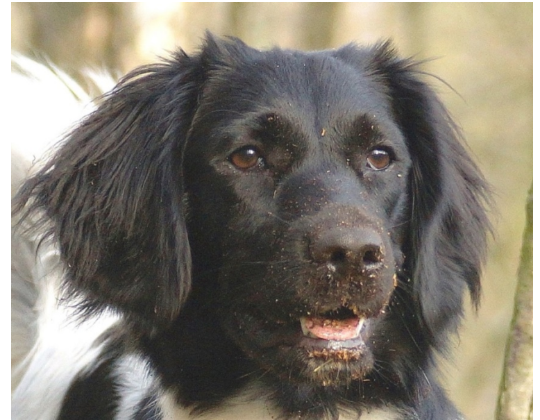
Stabijhoun (Frisian Pointing Dog)